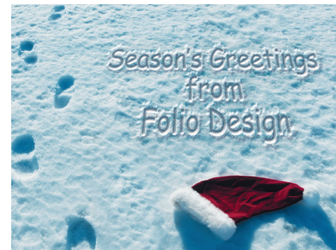
Message in the Snow

If you would like to order additional items please contact Bex, however there may be a small charge.